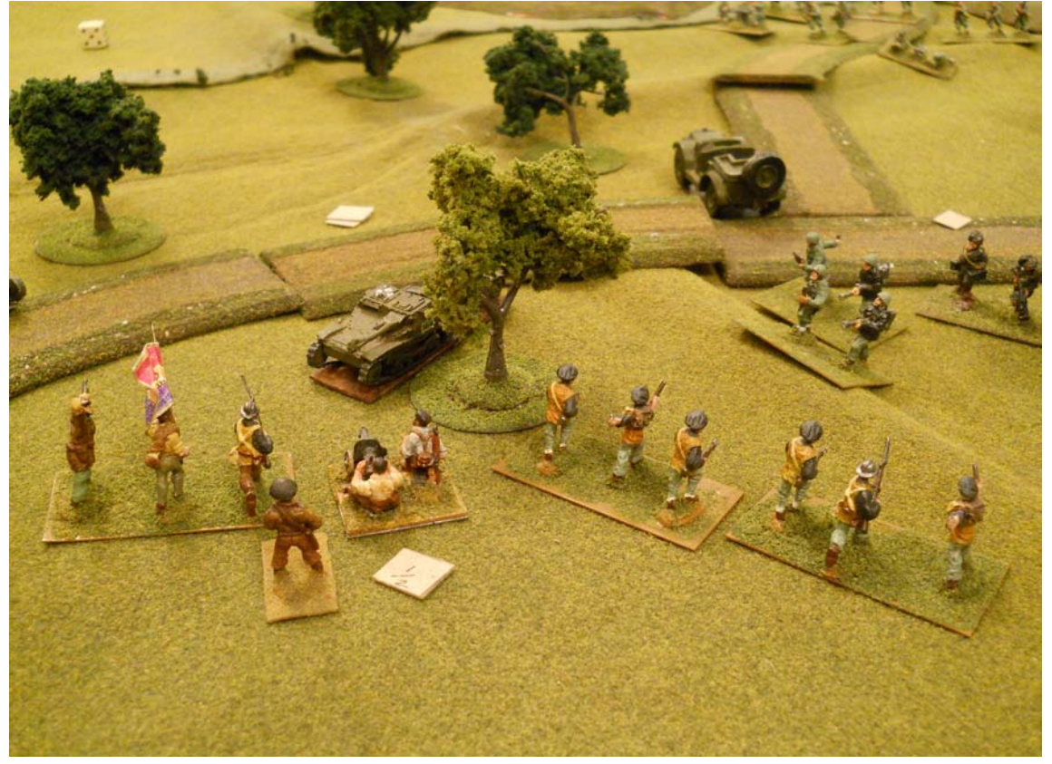
Flame Thrower and MG elements Meet Internationals at the Edge of the Bosque