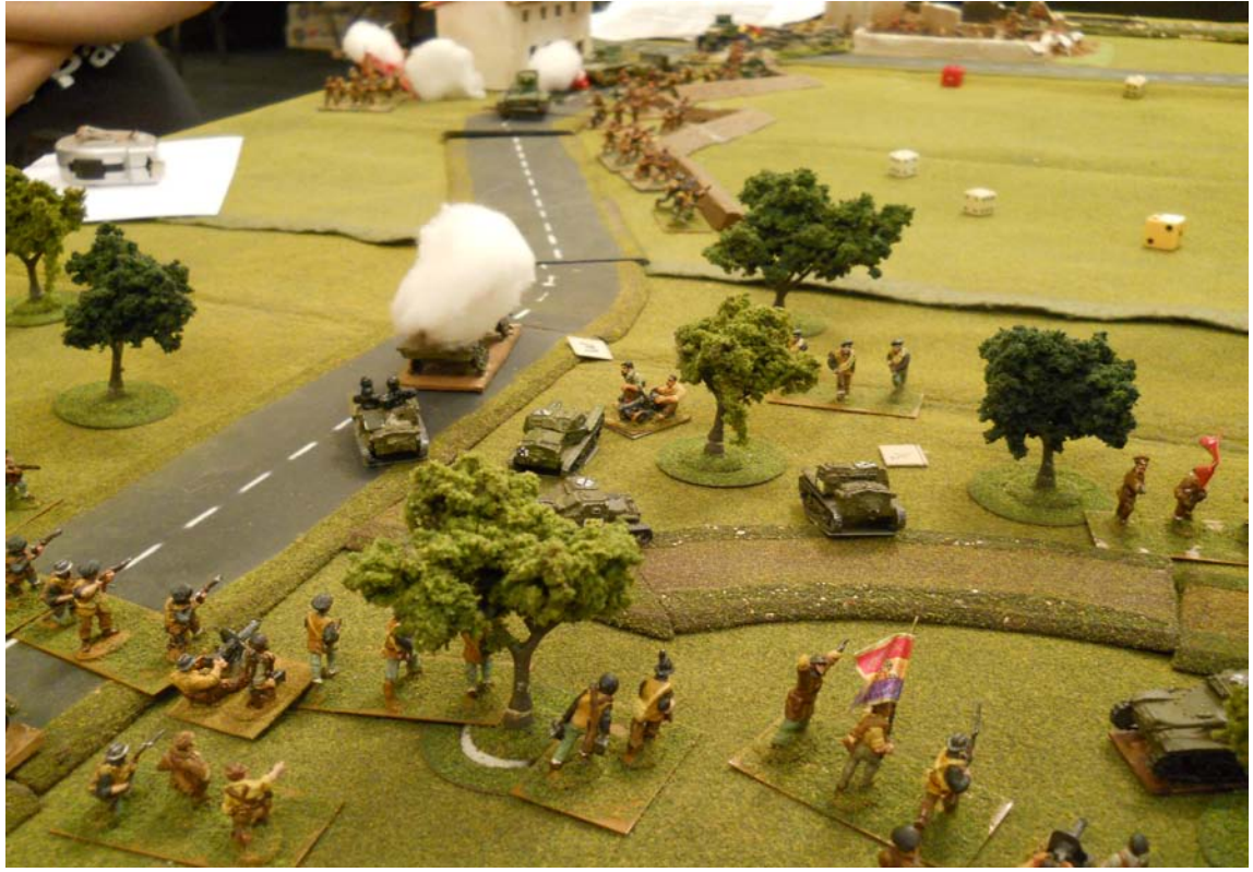
Tankettes Massacre A Truck Borne Battalion