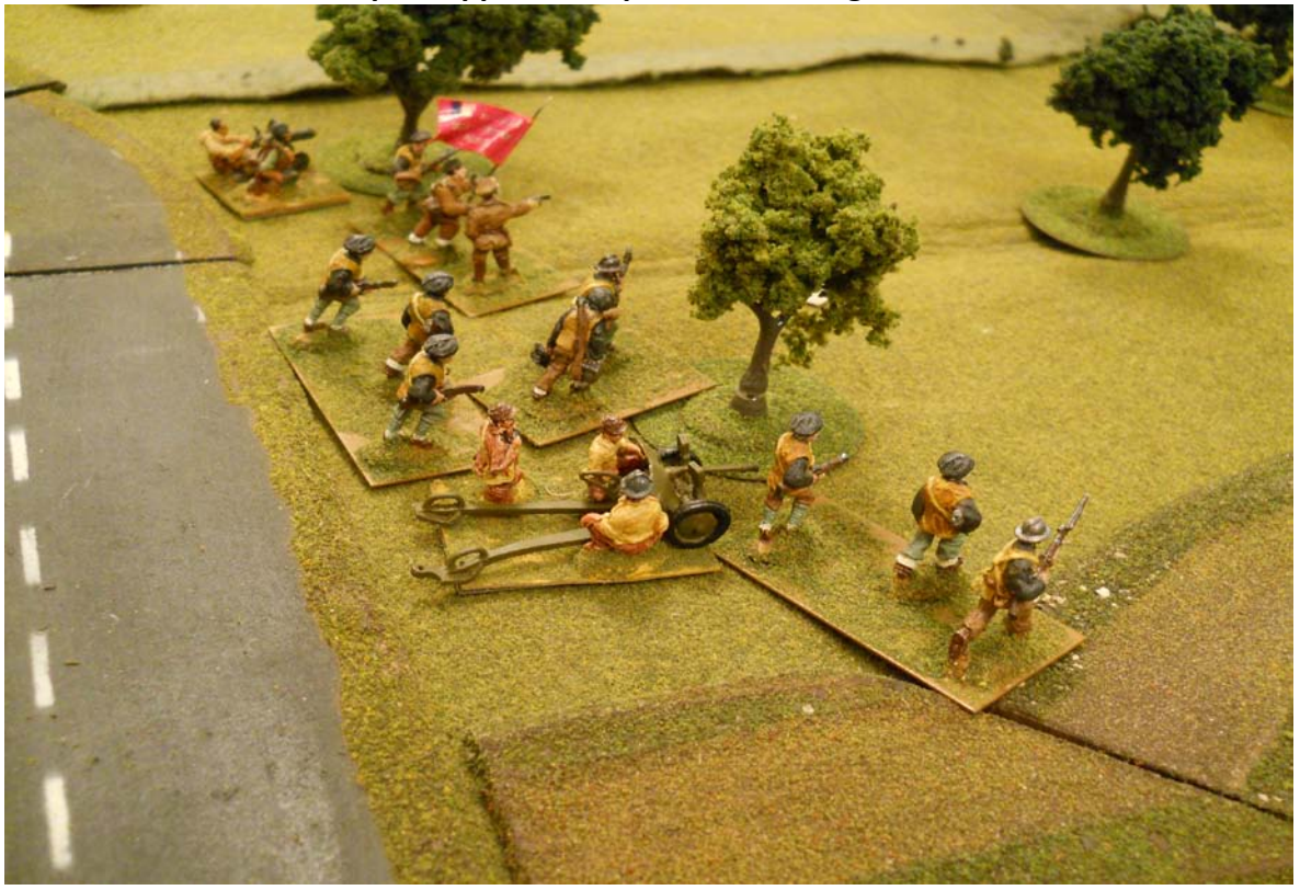
Andre Marty Battalion Enters the Bosque de Torija with Hotchkiss AT battery