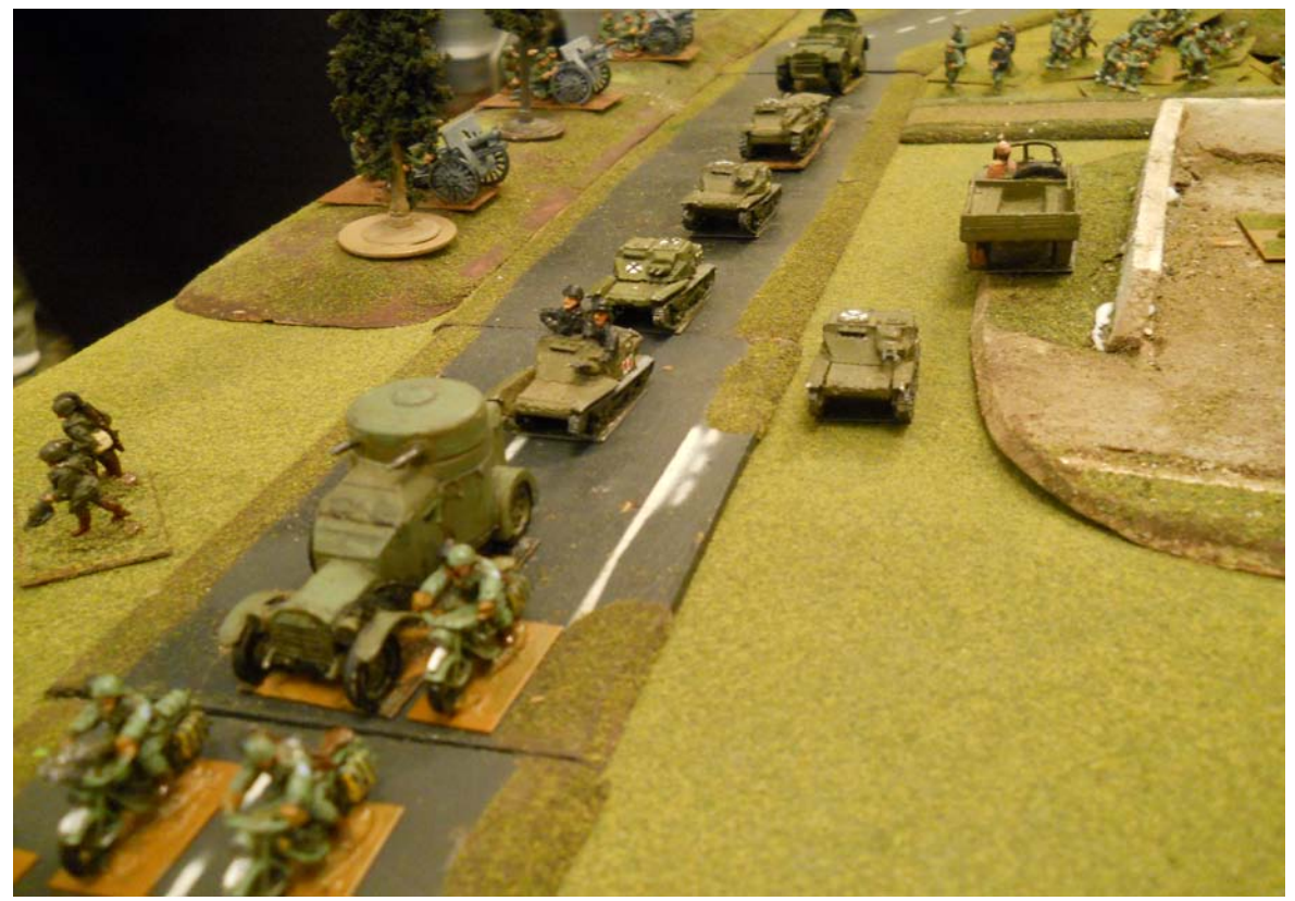
Rapid Support Group on the Brihuega Road