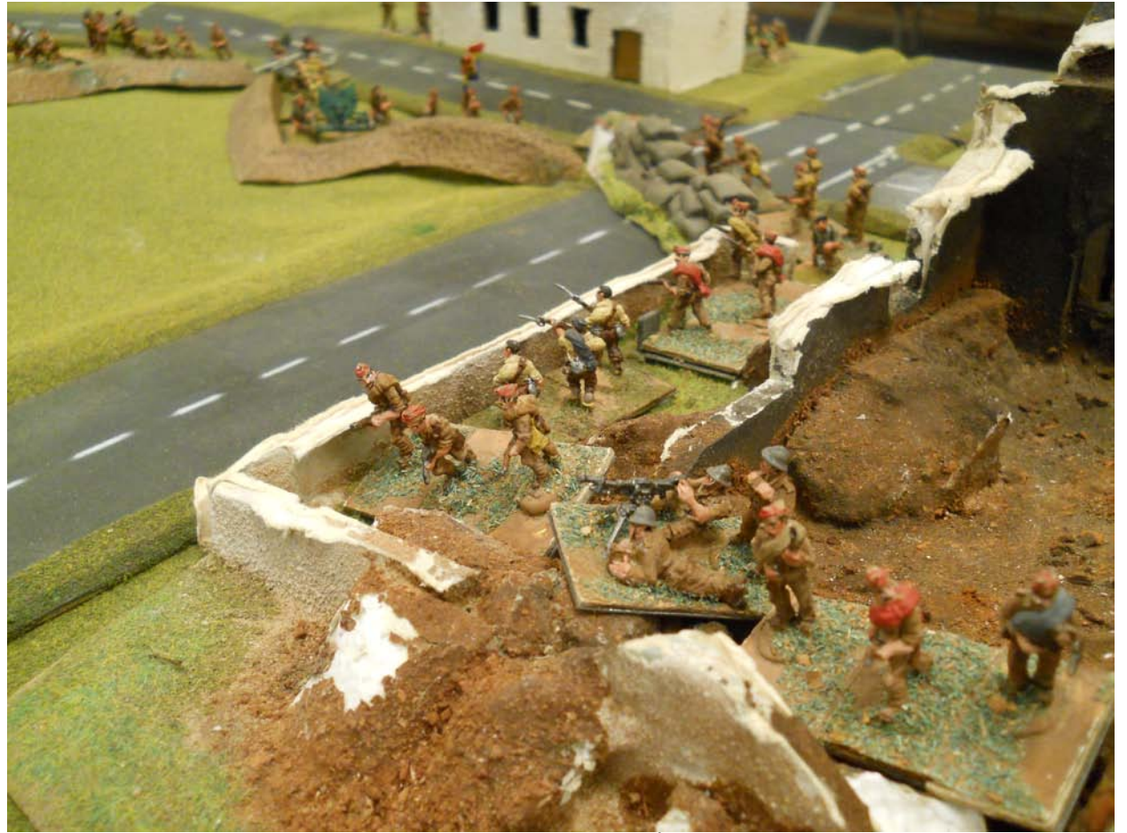
Elements of the 1<sup>st</sup> Bis, A Spin Off of the PCE 5<sup>th</sup> Regiment Dug In at Trijuique

DISASTER ON THE CARATARA FRANZIA SIEGE OF AUGUSTA 2011