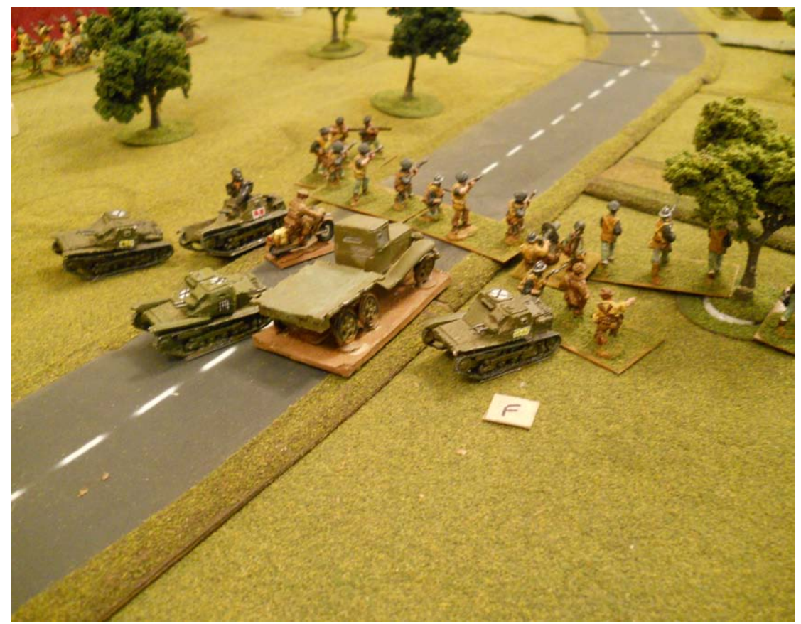
Charging Away From the Dread Russian Tanks, the Tankettes Break the Last Battalion of the XI Internationals

Once again the CTV had reversed history. I'm obviously going to have to tighten up the rules and pay closer attention when they next launch a Blitzkrieg with silly little tankettes. Even with the recent reverses, overall the Republicans are ahead in the series, both when it comes to the Caratarra Battle near Trujuique and the storming of Brihuega down the road.