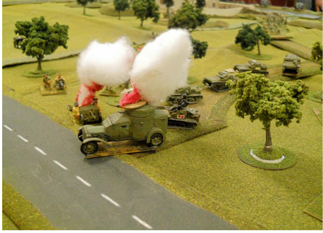
So with the loss of the antique armored car company they overran the guns