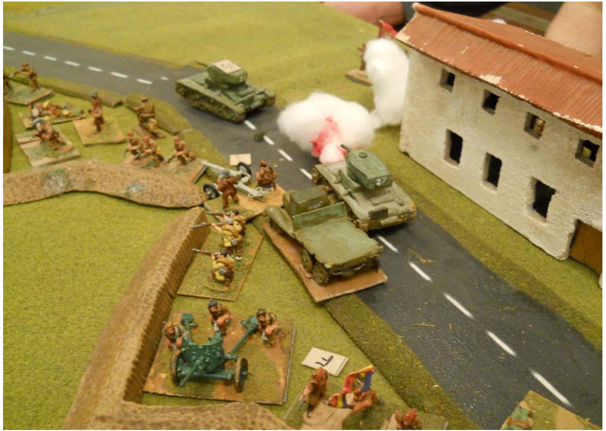
Tank Companies Rush to the Aid of the Internationals-Slowly

At that point not only was the umpire thrown off by the rapid moves of the CTV. The Republican players reacted badly. Instead of rushing their tanks full speed down to engage with the CTV, which would have made them hard to hit with indirect fire, and virtually impervious to the silly little Italian tankettes, they moved a half turn and halted to fire-outside of the direct fire range of their 45mm AT guns. That would leave the CTV with time to maul the XI IB before the dread Russian tanks fell on them.